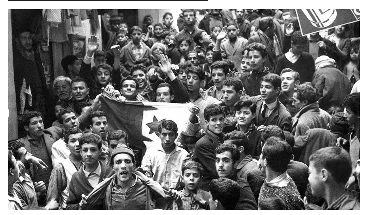
Street demonstration in Algiers during the Algerian War.