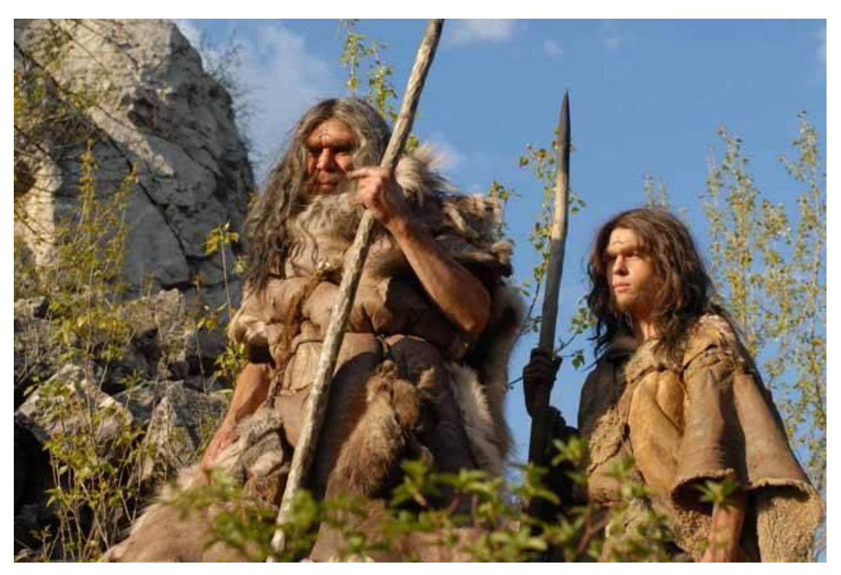
Mid Afternoon (Western Europe Time) Late Spring, Year 49,950 B.C.E. Valley of the Vézère, future region of Dordogne, France

The group of nine Neanderthals, which included four young children, had been walking along the right bank of the river, which would much later on be called the Vézère, looking for anything worthy of picking as food as they went. There seemed to be quite a few fish in the river so Tur, the leader of the small group, had promised himself to try some fishing once they would stop and establish a temporary camp in the evening. Up to now, this territory seemed very promising to Tur, with the river being an easy source of water and the forests and prairies on each bank sheltering animal life and wild berries and nuts. The river also flowed in a valley between two lines of rocky hills and cliffs, where the group could find shelter in case of rain. The temperature was above the freezing point and was quite reasonable in this late Spring, allowing the Neanderthals to travel with only a light attire of furs and deer skins. However, things had not gone smoothly for the group this year: one of their only three hunters, Nokta, had