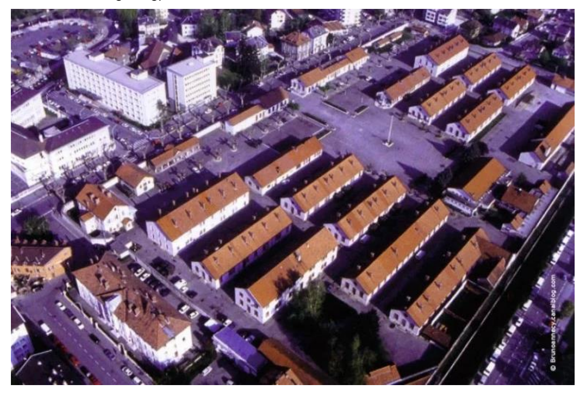
The Galbert Barracks in Annecy, Haute-Savoie. Home of the 27th BCA in 1955.

brownish-red roofs assembled around a large central parade square, in the middle of which stood a high flagpole.