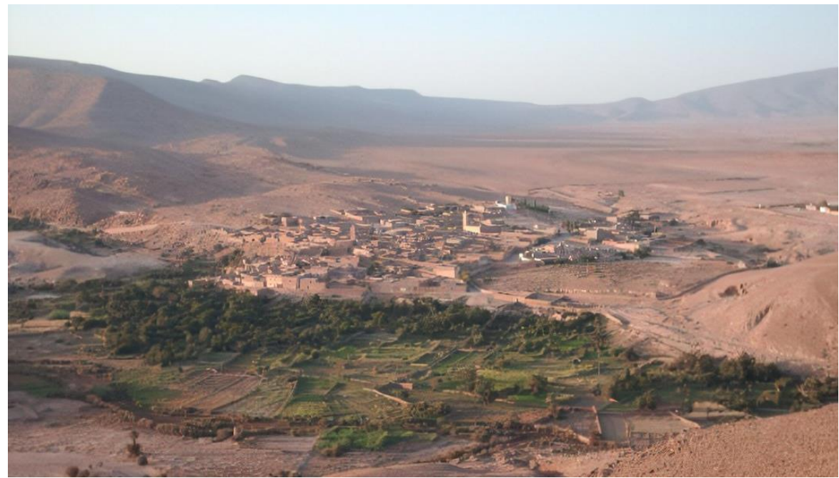
Ain Sefra, Algeria

16:01 (Algeria Time) Sunday, March 18, 1956 'B' Ain Sefra Train Station, Ksour Mountains Saharian Atlas Chain, Northwest Algeria