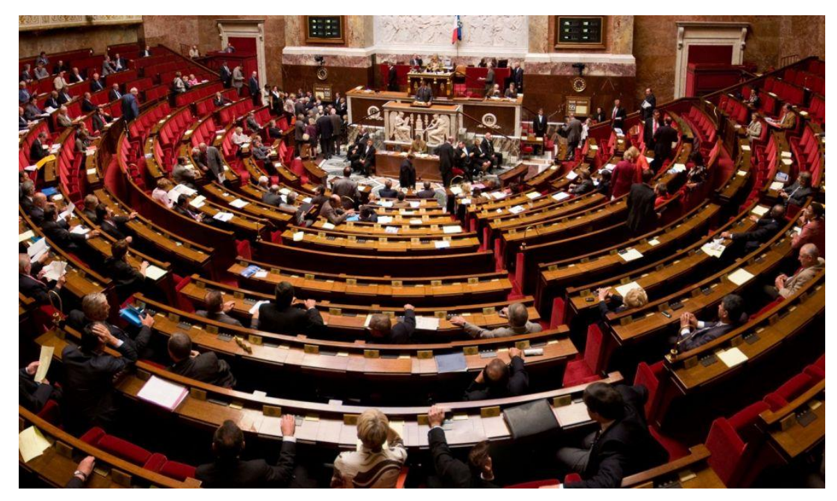
French Parliament in session.

11:03 (Algeria Time) Wednesday, September 12, 1956 'B' Headquarters of the French Forces in Algeria Algiers, North Africa