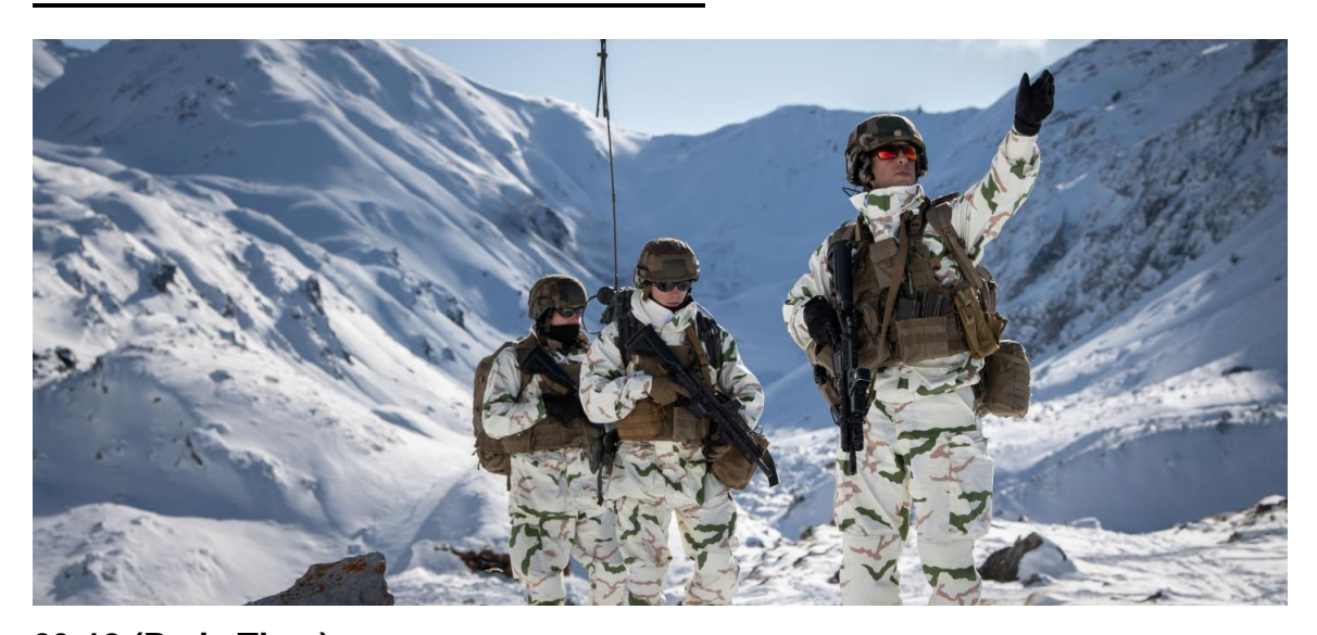
09:18 (Paris Time) Saturday, November 26, 1955 Barracks of the 27<sup>th</sup> BCA, Annecy Haute-Savoie, France

"Alright, men, gather around me: we have a new mission."