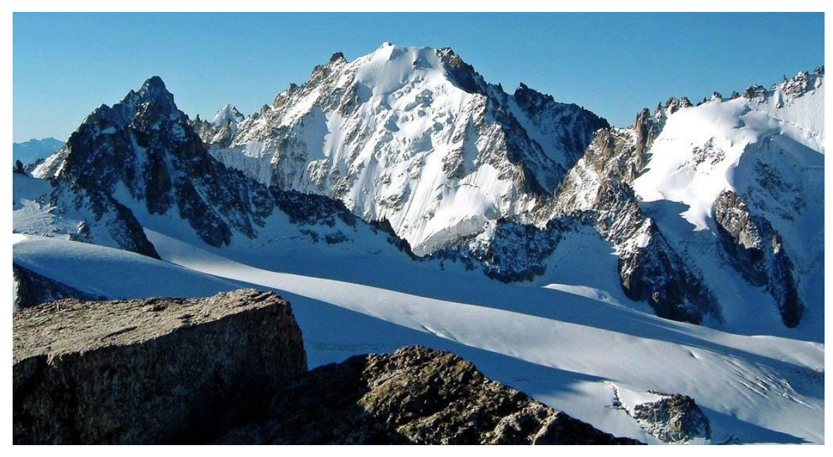
The Aiguille d'Argentière (3,901 meters), with the Glacier du Milieu, in the French Alps.

his group up to now, except for a few target practice sessions during the past few months.