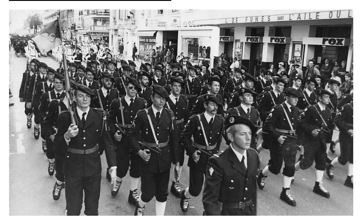
French Chasseurs Alpins parading down a street.